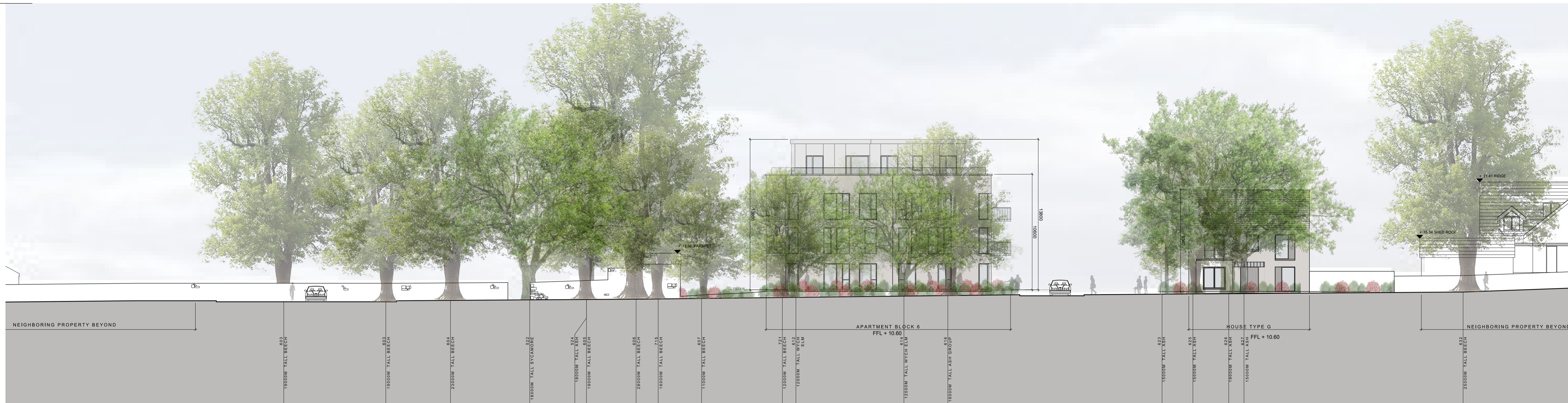
SITE SECTION C - C SCALE: 1:200 NOTE: SEE LANDSCAPE ARCHITECTS DRAWINGS FOR BOUNDARY TREATMENTS SEE ARBORISTS REPORT FOR DETAIL ON EXISTING TREES DOTTED RED LINE INDICATES SITE BOUNDARY