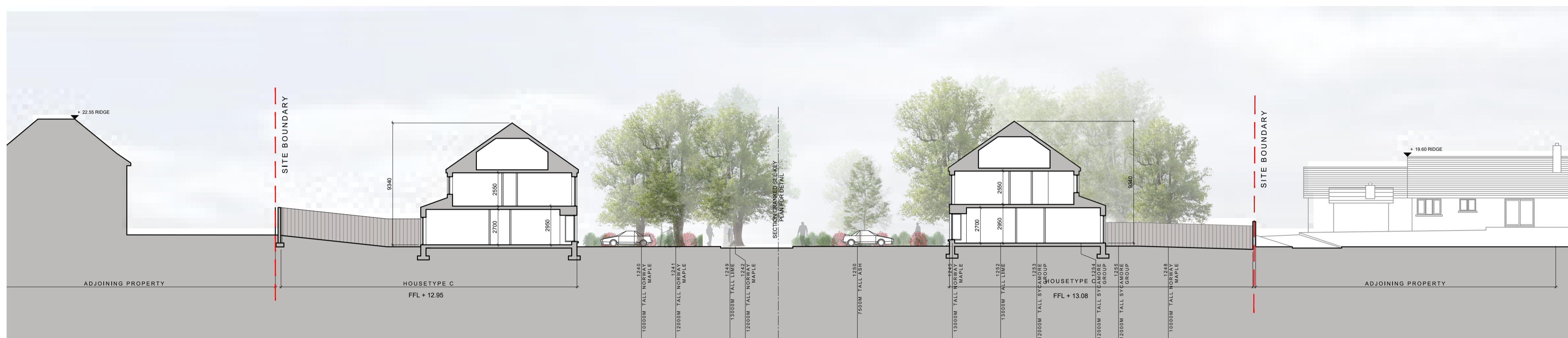
SITE SECTION D - D SCALE: 1:200 NOTE: SEE LANDSCAPE ARCHITECTS DRAWINGS FOR BOUNDARY TREATMENTS SEE ARBORISTS REPORT FOR DETAIL ON EXISTING TREES DOTTED RED LINE INDICATES SITE BOUNDARY