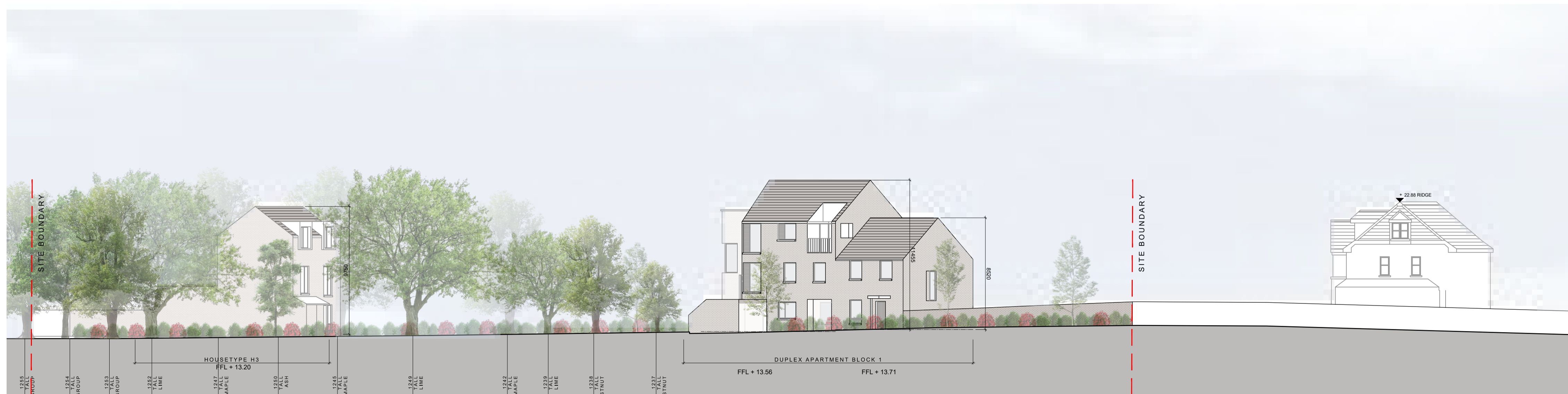
SITE SECTION E - E SCALE: 1:200 NOTE: SEE LANDSCAPE ARCHITECTS DRAWINGS FOR BOUNDARY TREATMENTS SEE ARBORISTS REPORT FOR DETAIL ON EXISTING TREES DOTTED RED LINE INDICATES SITE BOUNDARY